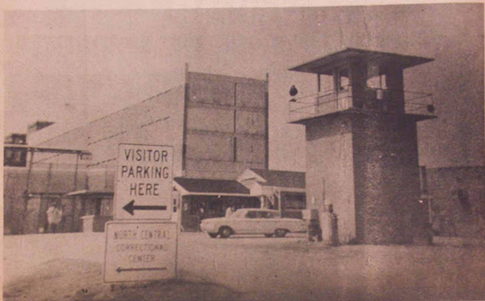
North Carolina's Central Prison (in Raleigh) has devised newer methods of repression. In this new "Maximum - Maximum" security unit "mentally disturbed" prisoners can be "calmed".

CAROLINA PRISON OFFICIALS REACH NEW LOW IN REPRESSION.