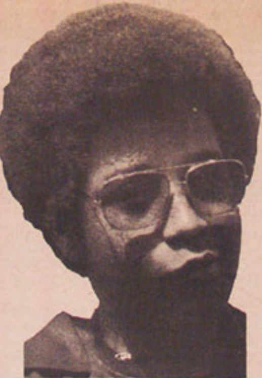
COMRADE GEORGE JACKSON and the MAN-CHILD were assassinated; Angela spent one year in jail. Is this America's justice?

While Angela remained incarcerated for a year, they used every propaganda media available to distort and twist a million events and present the picture of a murderess. After all, with all the support she had gained from the U.C.L.A. business, they couldn't just outright kill her. Even they knew that.