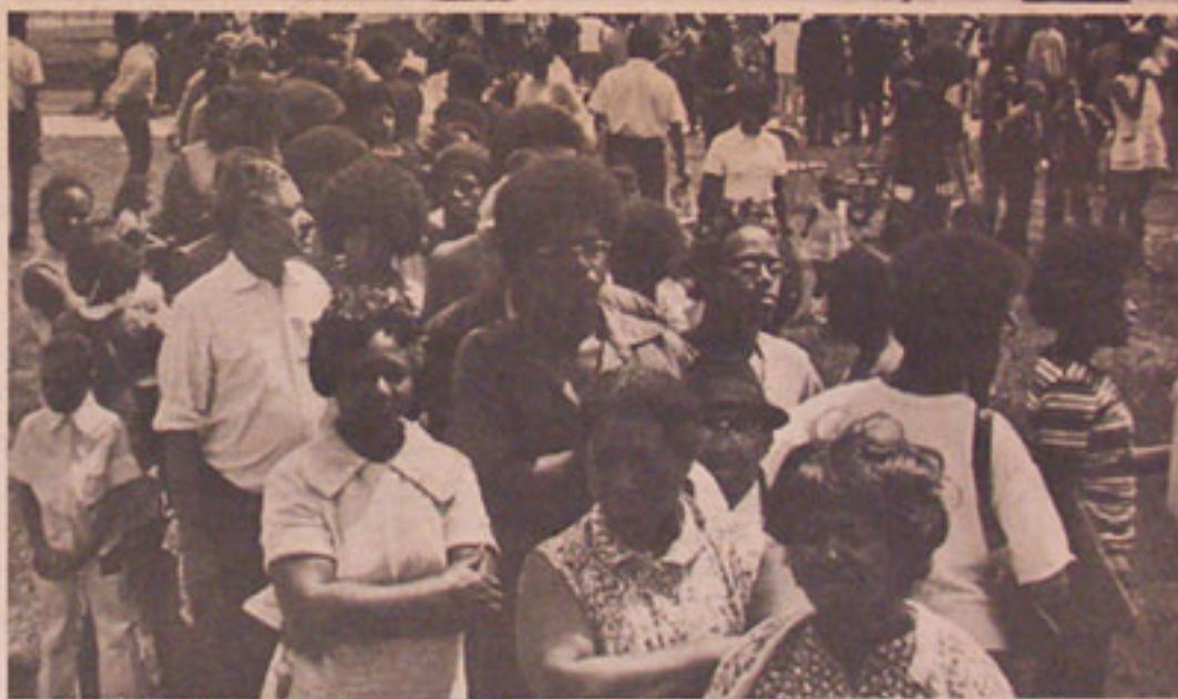
Many of the seven thousand people in Detroit's Jeffries Projects did not believe the food would be free. They had heard for years the promises of "a chicken in every pot".